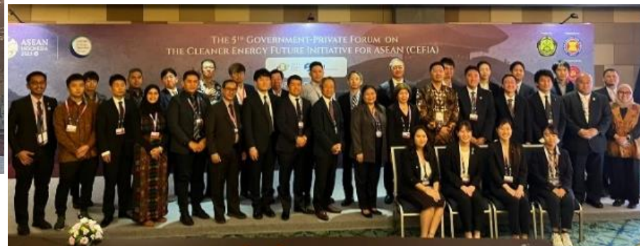
▲ Closing group photo