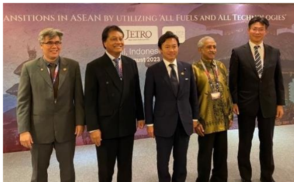
▲ Opening group photo