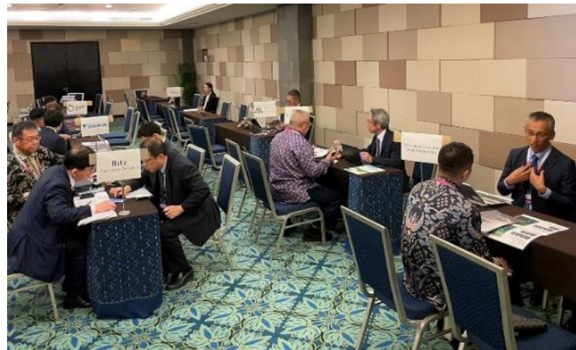
▲ Business matching event