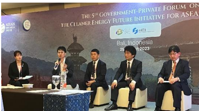
▲ Panel discussion