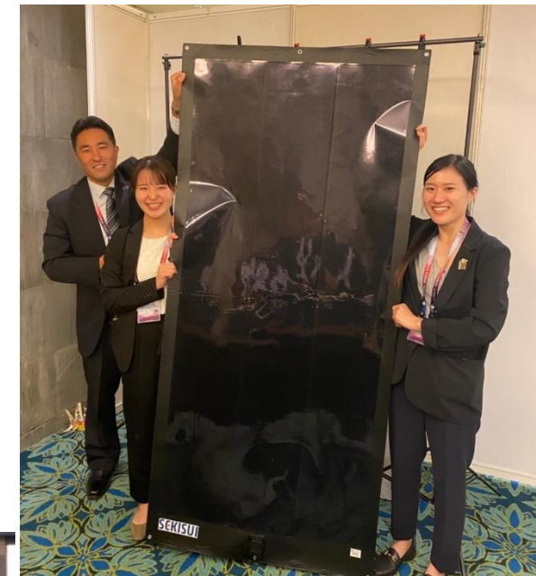
▲ Exhibition of perovskite-type solar cell