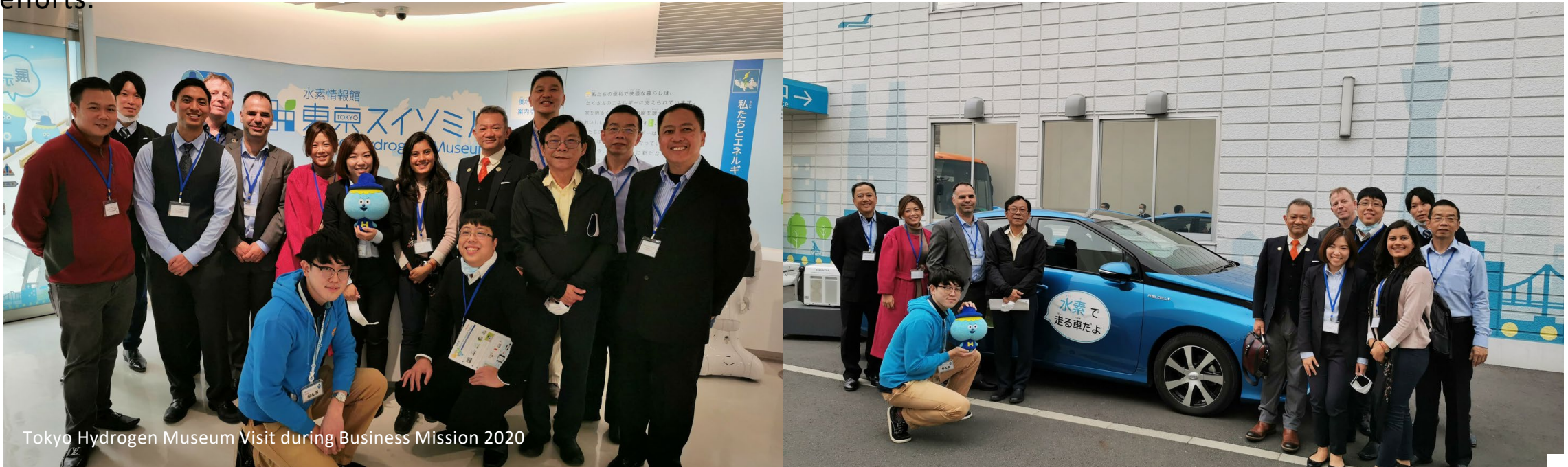
Tokyo Hydrogen Museum Visit during Business Mission 2020

It is important to instill public confidence on the use of hydrogen to support our decarbonisation efforts.